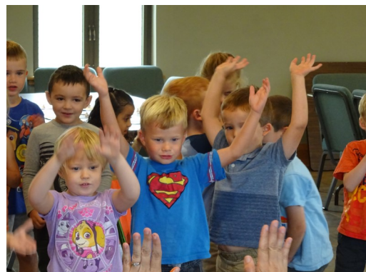
Grandpeople's Day on September 8 th